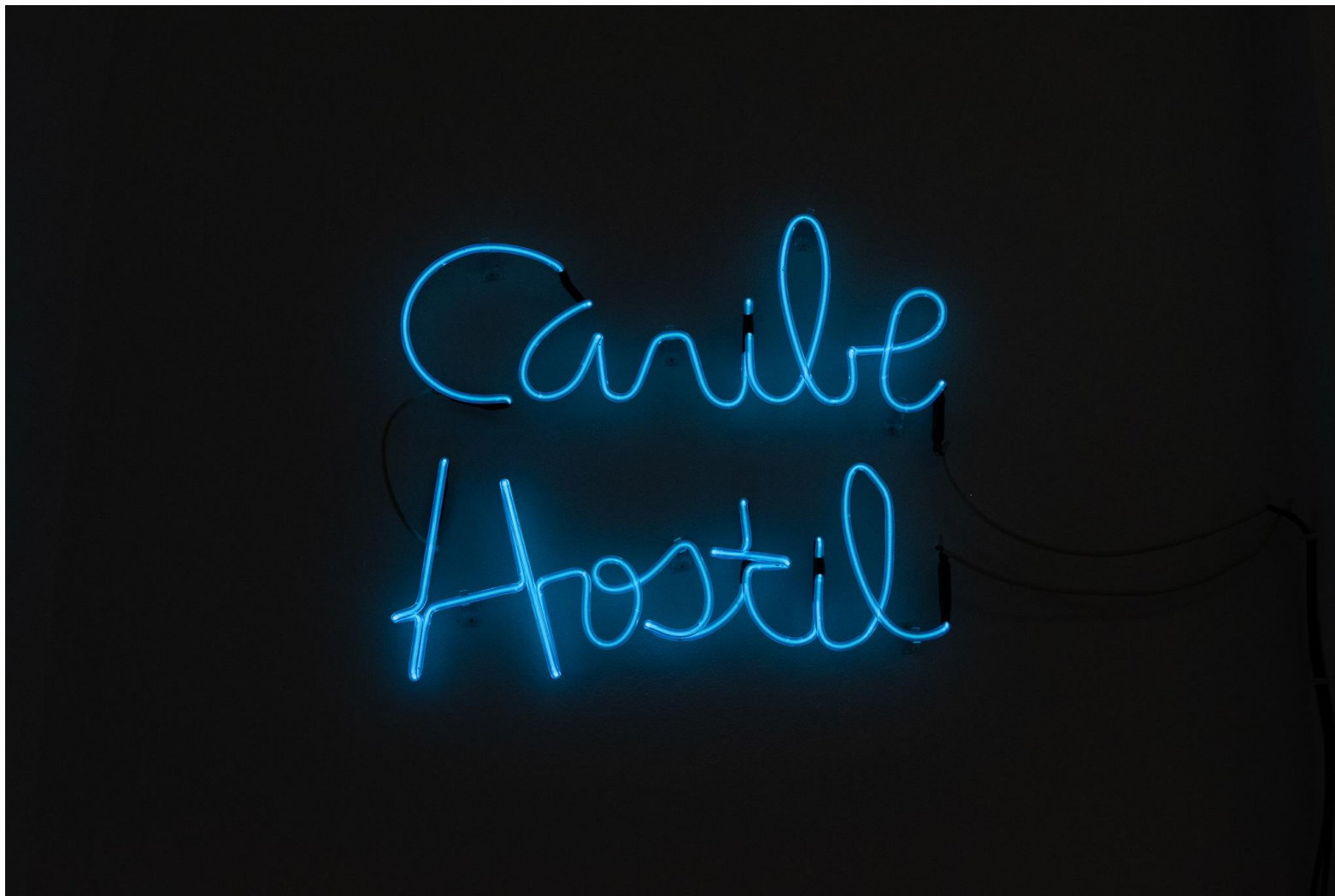
Caribe Hostil neon sculpture 36" x 20" 2020 3/3 + 2 P/A