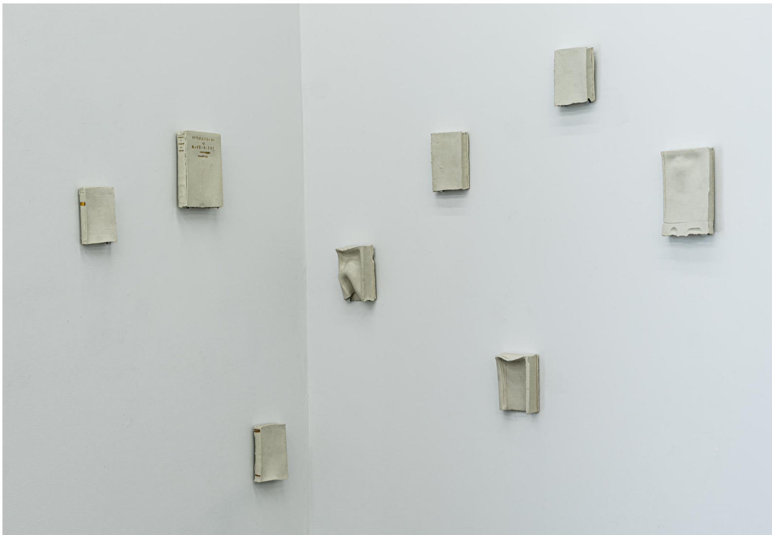
White library (series) Limoges Porcelain in Cast 4.33 x 5.51 x 1.77 in 2020