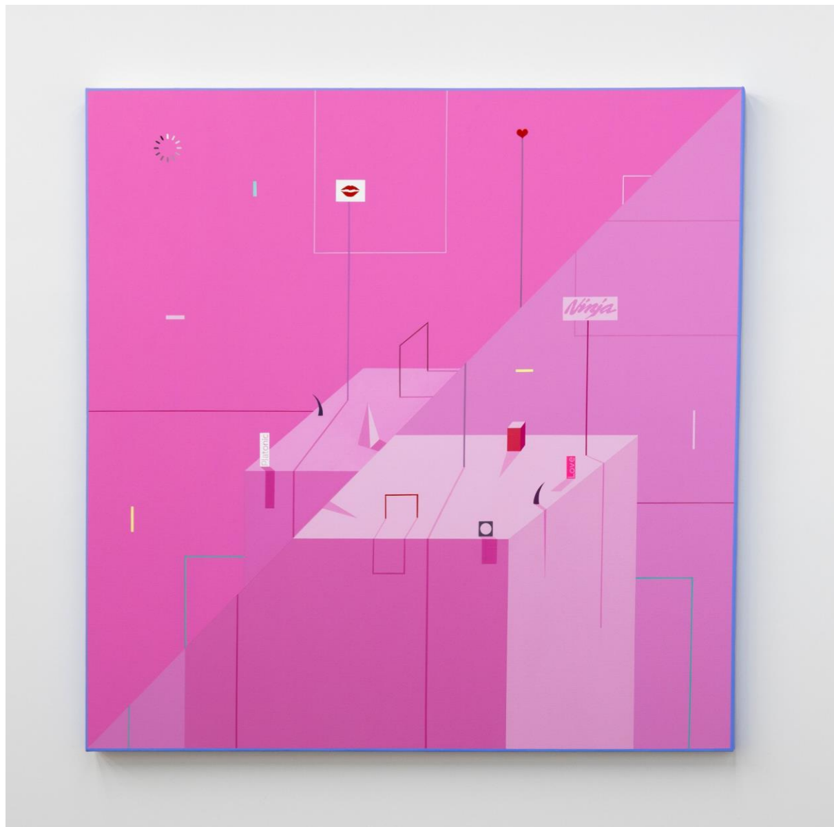
Pinky Promise Acrylic on canvas 59.6"x59.6" 2024 $4,500