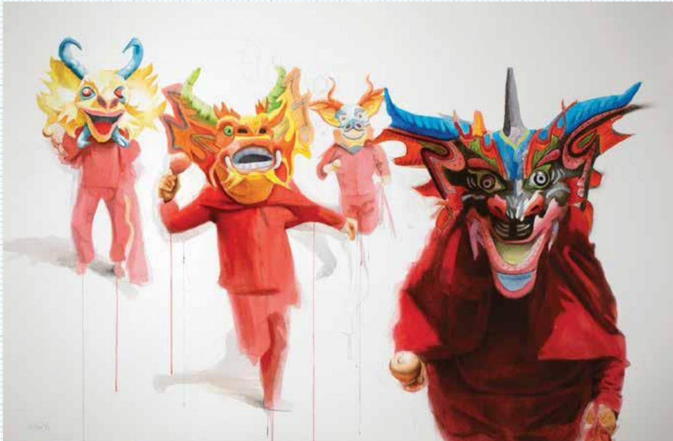
1. 2022. "The dancing spirits". Mixed media/watercolor paper. 60 x 40 in.